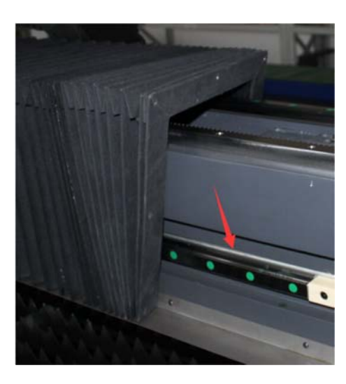
Linear Guide & precision ball screw drive