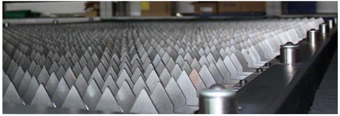
Aluminium saw tooth platform - prevents reflection