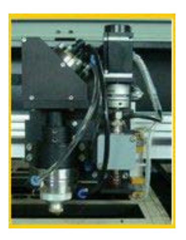
Auto Focus head