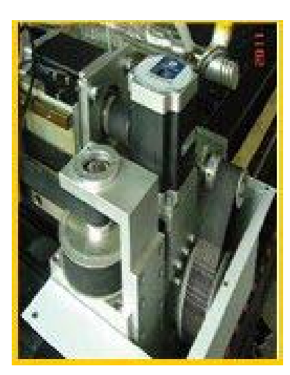
Hybrid AC servo motors