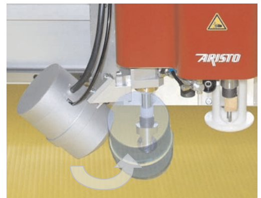
Software-driven change of direction of the light source.