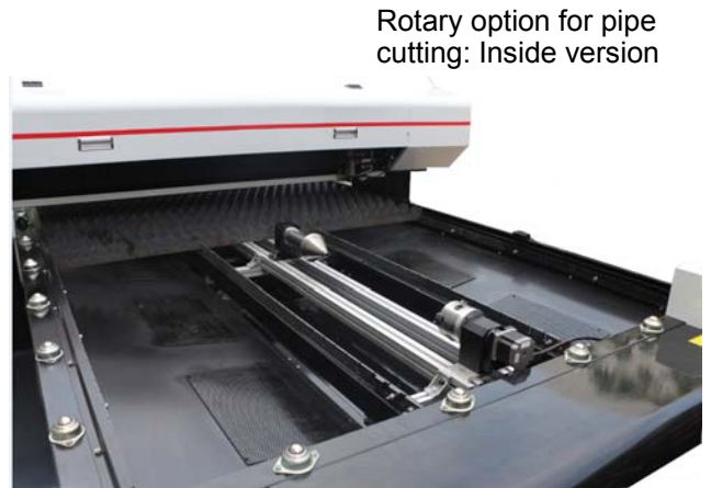
Rotary option for pipe cutting: Inside version