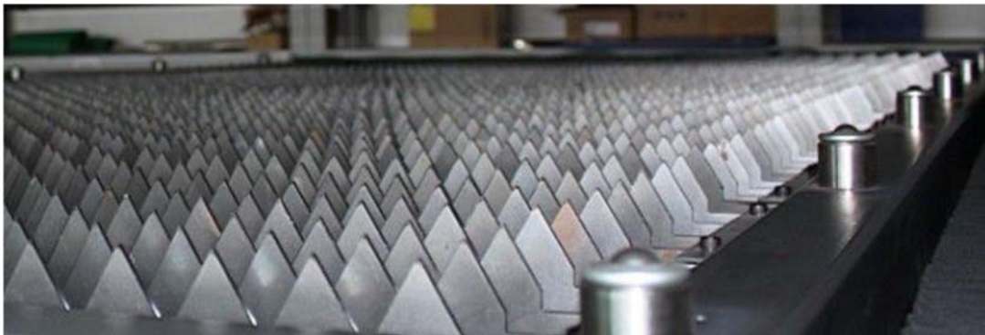
Aluminium saw tooth platform - prevents reflection