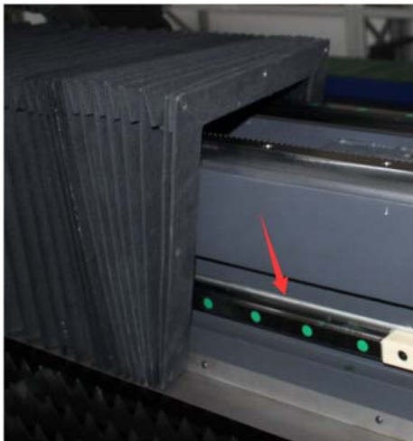
Linear Guide & precision ball screw drive