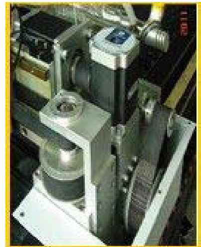
Hybrid AC servo motors