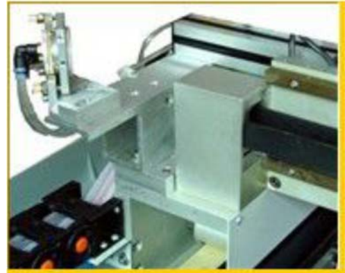
Industrial Modular Aluminium Structure