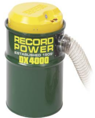
Dust collector option DX1000 & DX4000