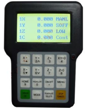
User Friendly Controller

Our router works seamlessly with the Delcam software and utilizes all the advantages available in the software. It is the best solution for the orthotics industry.